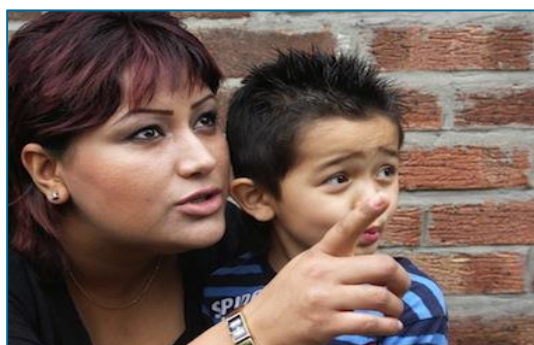
The future is bright - a new service for mothers and children

Healthwatch Hillingdon has continued to support the Hillingdon Maternity Services Liaison Committee (MSLC), the group which oversees the quality of maternity services in the borough. Based on the feedback we collected from women using maternity services, we highlighted the lack of a perinatal mental health services for local women.