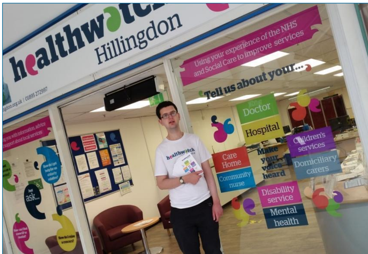
Making our presence felt on the high street - the Healthwatch Hillingdon shop

This local hub is vital to our work and we look forward to continuing our excellent relationship with the Pavilions in the coming year.