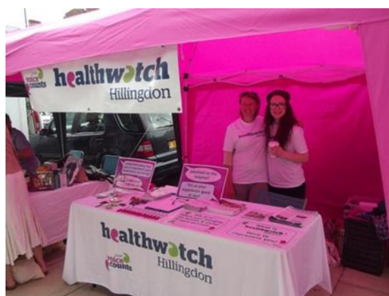
Pointing the way at the Ruislip Fun Day

Our staff and volunteers try to help individuals resolve local issues wherever possible. This approach has worked well; it helps us connect with our local community and allows us to work co-operatively with providers to improve the quality of care. This approach can only work through strong partnership working, and we thank those organisations, such as Hillingdon Hospital and CNWL, that have embraced and supported this approach.